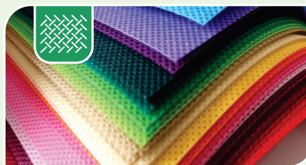
Non-Woven & Technical Textile