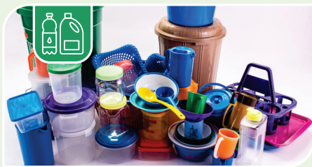
Plastic Mold Items