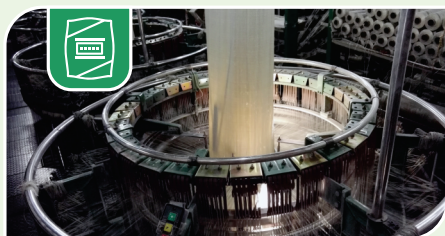
Woven Sack / FIBC